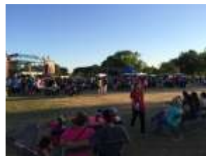
Crawfish Stage area for the group, "Los Lonely Boys"