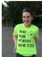
OTS Crawfish Festival visitor