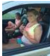
Chalk Mom & Chalk Kids at OTS Crawfish Festival, forgot to ask why they were all chalked up.